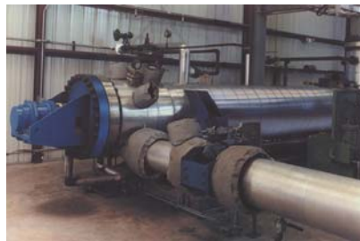
In Finland, xylitol is produced from birch chips and oat hulls in a patented process.

The pretreated biomass undergoes an extraction stage to deliver a concentrated xylan solution and a combined lignin/cellulose stream. Xylans are subjected to enzymatic hydrolysis to obtain xylose. Xylitol is obtained via the hydrogenation of xylose.